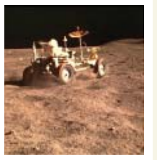
Another other-worldly car: the Lunar Rover used during the Apollo moon missions.

time" and drive one of these rovers on another planet yourself! We will keep you posted. \ensuremath{\,\textcircled{}}