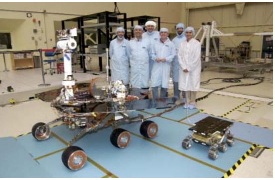
The Rover dwarfs the much smaller Pathfinder vehicle previously sent to Mars.

The Rover computer contains special memory to tolerate the extreme radiation environment from space and to safeguard against power-off cycles so that programs and data will not accidentally erase when the Rover shuts down at night. On-board memory is roughly the equivalent of that of a standard home PC (each Rover has 128 MB of DRAM and 3 MB of EEPROM).